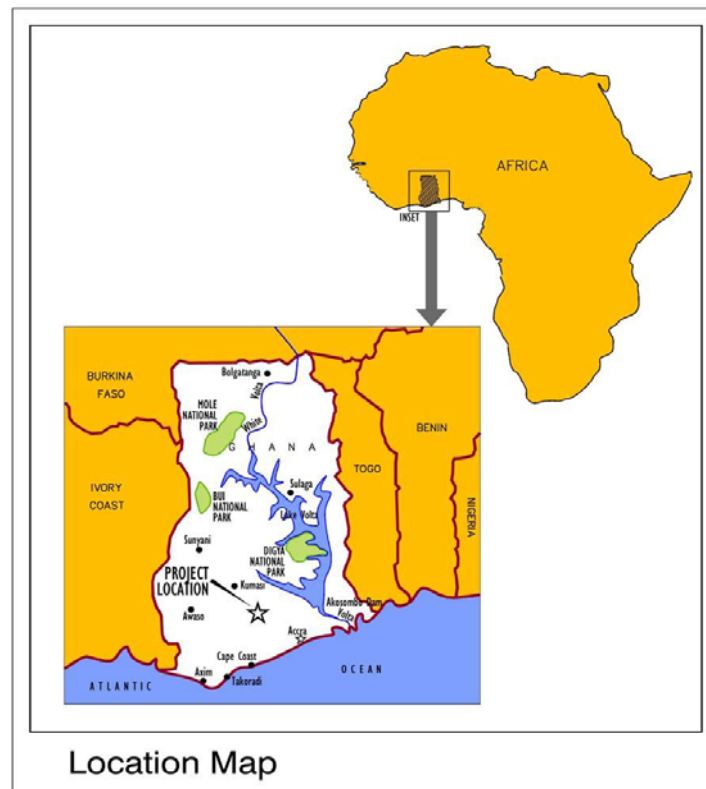
Figure 1.1: Location Map, Akyem Project

In 1997, La Source SAS, Gencor, and Kenbert Mines formed Golden Ridge Resources Limited. La Source subsequently acquired Gencor's interest, increasing its holding in the Company to 80%. In 1999, La Source transferred its share in the Company to Normandy Ghana Gold Ltd. In 2002, Newmont acquired Normandy and an additional 5% of Kenbert Mines Limited share to increase its holding in the Company to 85%. In late 2005 Newmont moved to 100% ownership when it acquired the remaining Kenbert share. In 2008, the name of the company was changed to Newmont Golden Ridge Limited (the Company).